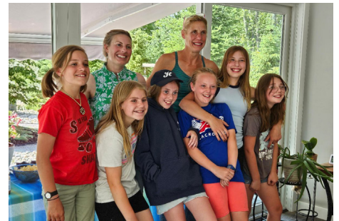
Thank you to these amazing young ladies!