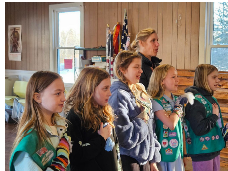
Members of Junior Troop #1263

What a perfect multigenerational pairing, young women looking to make a difference in their community and HAH looking to promote services to that same community. By connecting young and old, and everyone in between, the Girl Scouts discovered how helping others can mean a lot to them as well as to those receiving services.